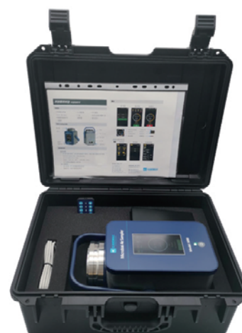
Carrying case Model 3080-70